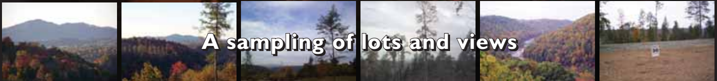
A sampling of lots and views

Gorgeous views... Privacy... Proximity to shopping, medical care, area attractions and amenities, and some of nature's finest showplaces... Protective covenants and underground utilities... All this and much more can be yours at River's Edge. Choose from lots ranging from 1 to 2.5 acres, resting on the most beautiful ridge line you have ever seen. Build your new home at River's Edge and enjoy your own personal slice of West Virginia's natural wonders.